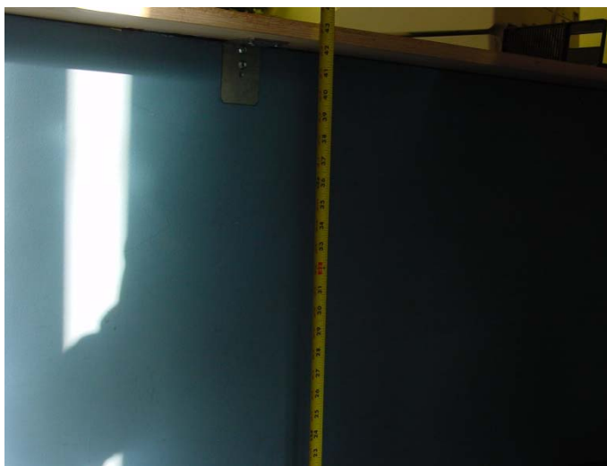
Counter at Main Entrance

Counter too high (43 inches instead of 36 inches)