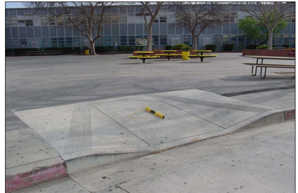
Curb Ramp at West Side of Building C at Service Road

Finding: The slope of the curb ramp is 10.3%. The slope at the top landing is 2.9%. The slope of the bottom landing is 11.7%. The slope of the side flares are greater than 10%. The transition at the bottom landing is abrupt. The curb ramp does not provide a detectable warning surface which includes truncated domes.