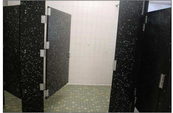
Boys Restroom Building M

Alternative Rec: * Rec: (Where Available)